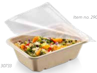
Item no. 30733