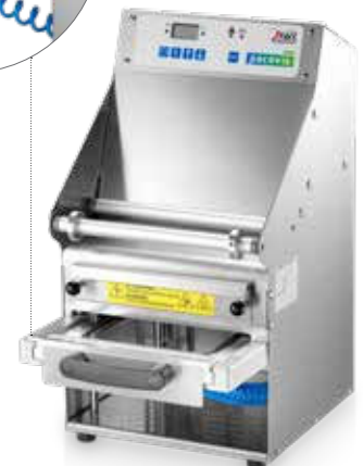
Item no. 30471