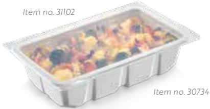
Item no. 30734